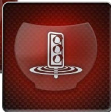
Red light camera

-This is now also asked for risk areas, the servers manage their relevance. We do ask you this question : is there any mobile control while you cross the zone ? See page 11