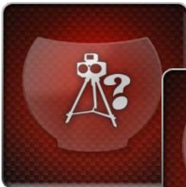
Frequent control area

-Mobile radars and traffic warnings are show with the nickname of the submitter and time since alert.